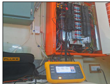
Logging Energy Losses, NBC, 2015/2016