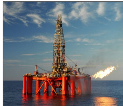
Stena Clyde, Gulf of Papua Drilling, 2014