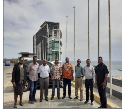
Tech team, Port Moresby, NCD, PNG